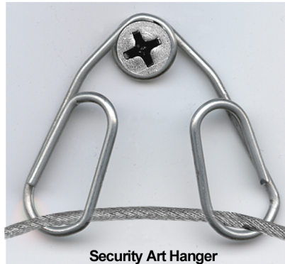
Security Art Hanger