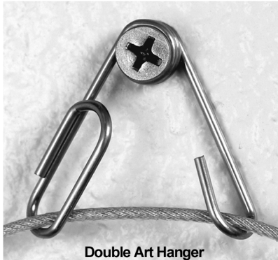
Double Art Hanger